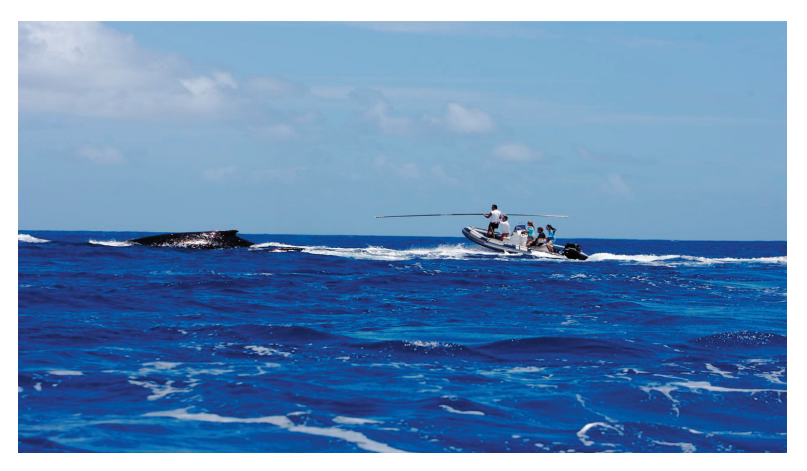
In 2007 scientists working in the South Pacific conducted a collaborative satellite tagging project in New Caledonia and the Cook Islands. By attaching a transmitter to a whale, its movements can be remotely followed on a daily basis by satellite.

In the four decades since those dark days, humpback whales have recovered remarkably well, in some areas. Off eastern Australia, for example, the population is now on the order of several thousand animals and continues to grow at a healthy rate. But in other places, including Fiji, New Zealand, and New