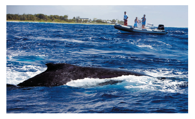
Satellite tagging, in combination with other nonlethal approaches, such as photoidentification, genetic analysis, and other techniques, can provide invaluable information for the conservation and management of humpback whales.

With either of these methods, an individual whale can be resighted or resampled again and again, giving us ever-more information about its movements over the course of years or even its entire life (something which, needless to say, is not possible when a whale is killed). Using these methods, thousands of whales have been documented traveling over sometimes huge distances. For example, in the North Atlantic, some humpback whales have been followed for more than 30 years and observed