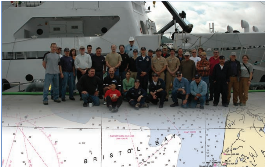
Multidisciplined FISHPAC crew members including NOAA ship Fairweather, RACE, UNH CCOM, NUWC and private contractors, standing over a section of their surveyed area.

Three different instruments are utilized to interpret the sonar records, each providing unique and complementary information about the benthic habitats being surveyed. An upgraded version of the Towed Automatically Compensating Observation System (TACOS) provided real-time high-resolution digital video for mosaicking. 2 The Seabed Observation and Sampling System (SEABOSS) complements TACOS by providing a close-up image of the undisturbed bottom as well as a physical sample of sediments and associated infaunal organisms. 3 An ODIM Brooke Ocean (Dartmouth, Canada) Free-Fall Cone Penetrometer (FFCPT) mounted on a moving-vessel profiler (MVP) not only provides information used to infer sediment type according to geophysical principles, but also has an integrated sound-speed profiler for measuring the speed of sound throughout the water column.