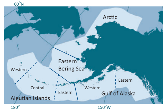
Figure 1. LMEs and ecoregion boundaries in Alaska. Highlighted area indicates the extent of the 200 nautical mile Exclusive Economic Zone.

Participants on the expert teams were selected to represent diverse scientific, management, and fishing expertise in the ecosystems from within and outside AFSC. Teams were developed for the EBS in 2010, for the AI in 2011, and for the GOA in 2014–2015. Structuring themes were chosen to help guide indicator selection; these were “ecosystem productivity” for the EBS, “spatial variability” for the AI, and “complexity” for the GOA. Teams selected indicators either in person during 1–2 workshops or by voting in an online query. The goal of the workshops and online