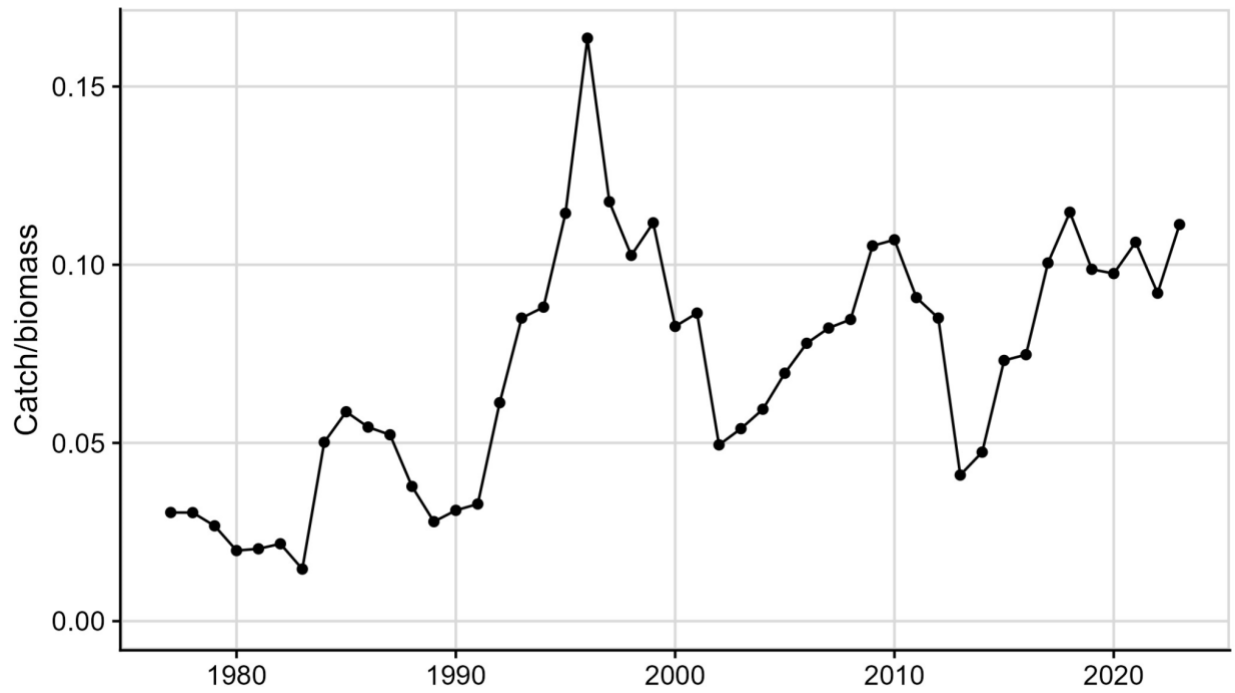
Figure 1. Modeled catch (t) divided by modeled total (age-1+) biomass (t), where estimates for 1977-2021 come from the 2022 assessment model and estimates for 2022 and 2023 come from the projection model.